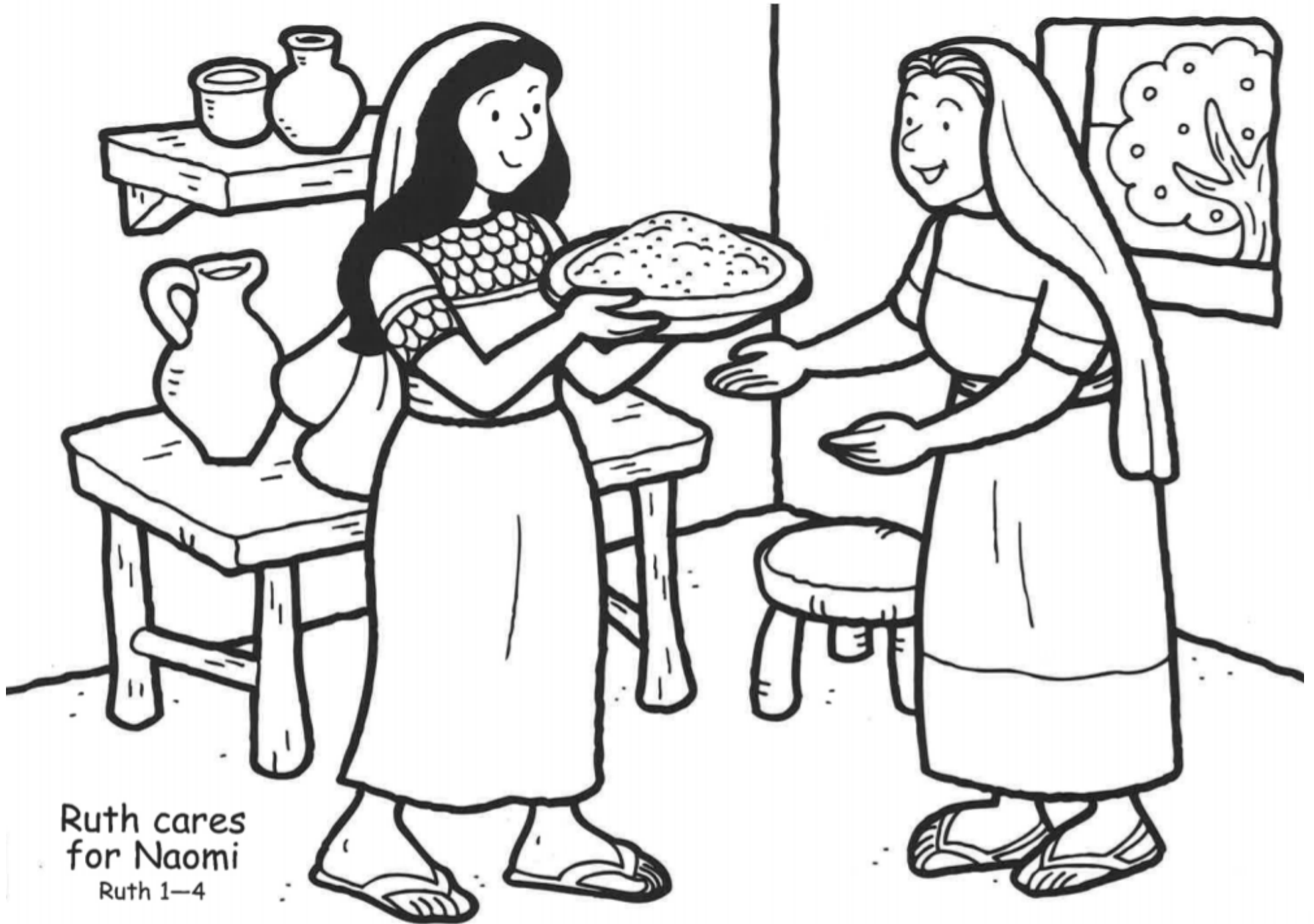
Ruth cares for Naomi Ruth 1-4

God was with Ruth and Naomi in their new home. God is with you. Where do you go?